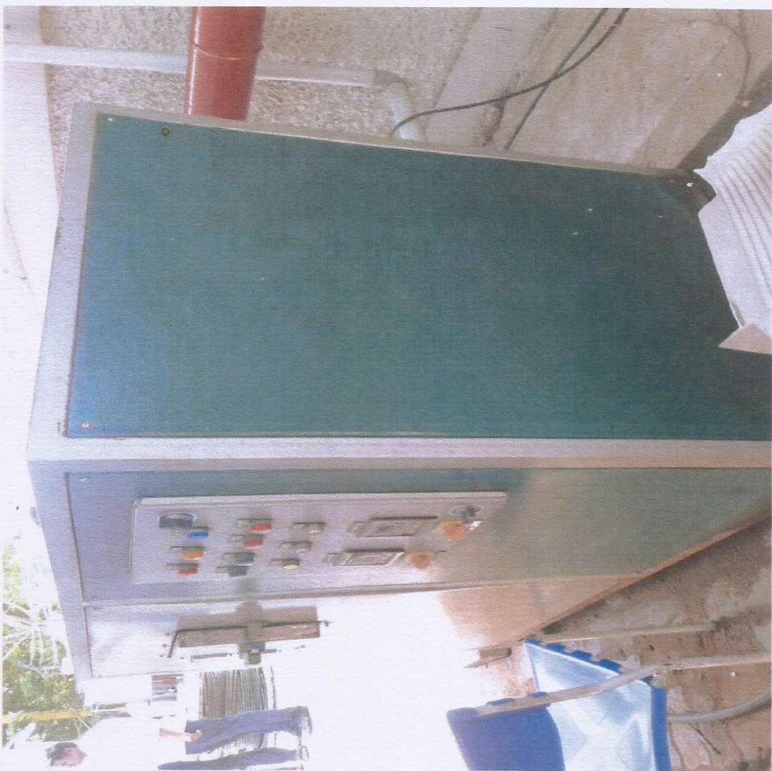
TIDAL Park, OMR